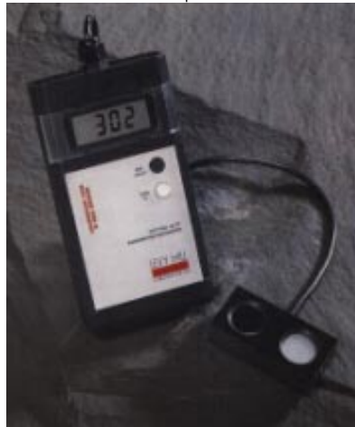
Levy Hill MkVI combined UV/Vis radiometer/photometer

Such is the importance of these checks is that they are prescribed by various standards bodies. Such standards include British Standards BS4489 and BS667, Civil Aviation Authority Air Worthiness Notice 95 and Rolls Royce Standard RPS702.